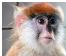
1 patas monkey Erythrocebus patas Calabar