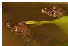
6 Dwarf crocodiles Osteolaemus tetraspis Calabar