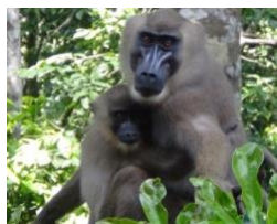
575 drills Mandrillus leucophaeus 6 Afi groups/1 Calabar

Animals are the easiest part of the job: give them what they need, they generally do the right thing - if only people were so predictable! The chimpanzees recovered from a respiratory infection that affected almost the whole group; adult female Lucy was critical for a few days. We may never know what microbe it was, but it terrified staff and kept them up monitoring 24/7. Adult male drill Adrian was moved to Calabar for a broken leg and we are hopeful he recovers to resume his dominant role in Group 2.