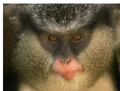
2 Mona monkeys Cercopithecus mona Calabar