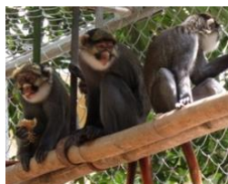
11 Sclater's guenons Cercopithecus sclateri Calabar