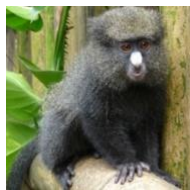
1 putty-nose guenon Cercopithecus nictitans Calabar