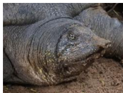
1 softshell turtle Trionyx triunguis Afi Mountain