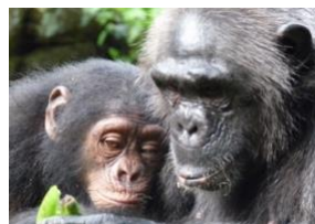
28 chimpanzees Pan troglodytes Afi Mountain