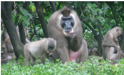
617 Drills Mandrillus leucophaeus 6 Afi groups/1 Calabar