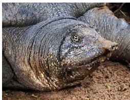
2 Softshell turtles Trionyx triunguis Afi Mtn./Calabar