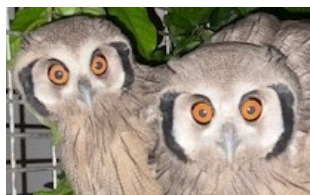
2 White-faced Scops owls Otus leucotis Calabar