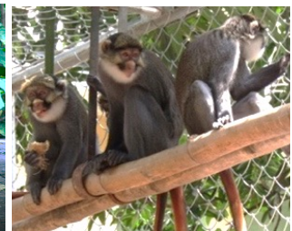
11 Sclater's guenons Cercopithecus sclateri Calabar