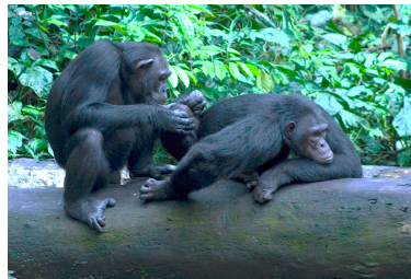
27 Chimpanzees Pan troglodytes Afi Mountain