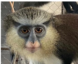
3 Mona monkeys Cercopithecus mona Calabar