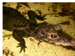
1 Dwarf crocodile Osteolaemus tetraspis Calabar