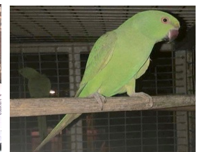
2 Rose-ringed parakeets Alexandrinus krameri Calabar